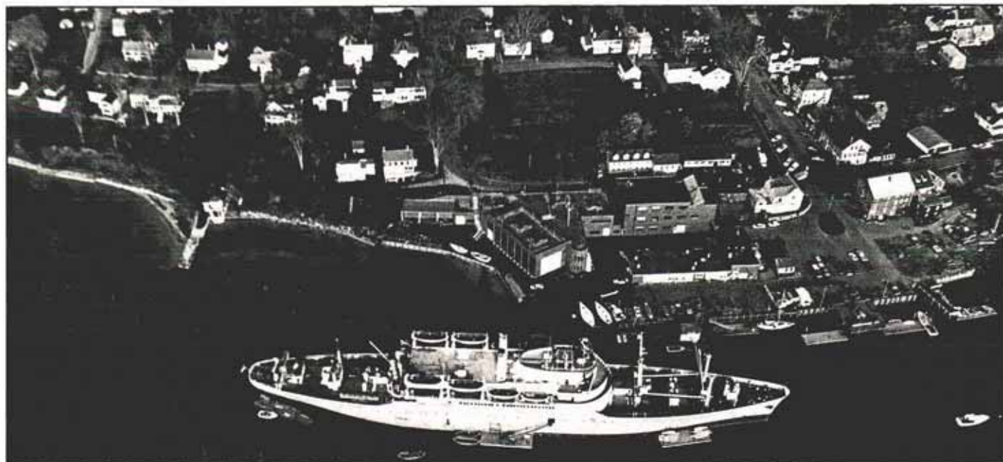
The 13,000-ton training ship State of Maine dominates the waterfront campus of Maine Maritime Academy in Castine. Launched in 1952, the vessel was known for 20 years as the Upshur , a U.S. Navy transport.

drives, the other charities, the caliber of men in the lodges — all that convinced me that it was the kind of organization I wanted to belong to.