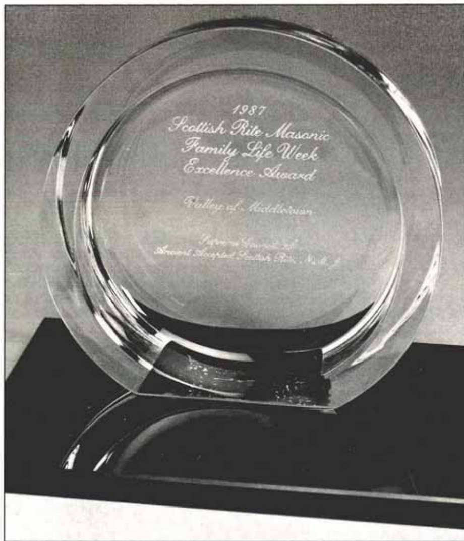
The Valley of Middletown, N.Y. received the top award for excellence.

dinner was held which included parents and teachers.