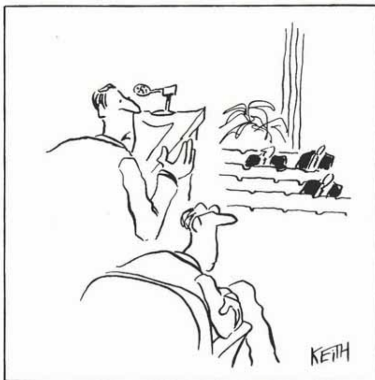
"Look at it this way. The Lodge isn't half empty — it's half full."

(2) Again the new idealism of practical philosophy meets our second re-